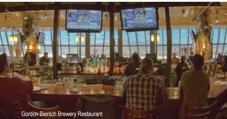
Gordon Biersch Brewery Restaurant