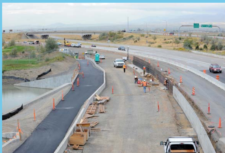
The new light rail line under construction at Salt Lake City International Airport

replaced with two new elevators. This project is about 40% complete.