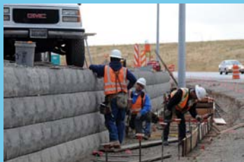
Retaining walls installed as TRAX enters the Airport

A single elevator on the lower B concourse is being removed and