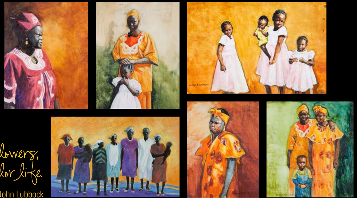
Top of CONCOURSE B Collection by Bevan Chipman The Faces of Sudan

As the sun colors flowers, so does art color life. —John Lubbock