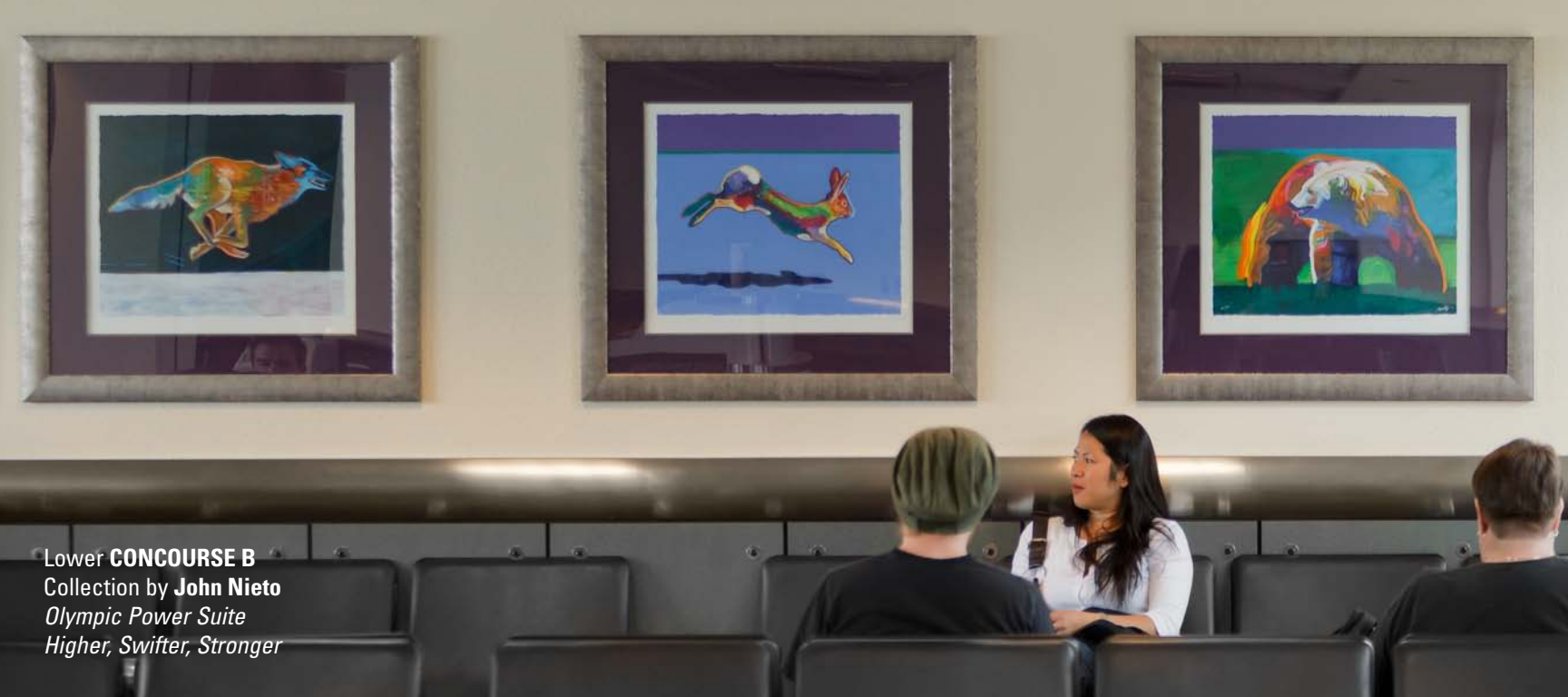
Lower CONCOURSE B Collection by John Nieto Olympic Power Suite Higher, Swifter, Stronger