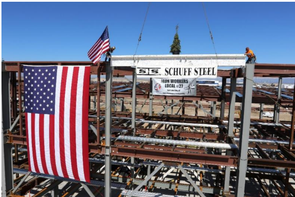
Topping Out Ceremony.

The North Concourse broke ground in January 2018, and since that time workers have installed thousands of stone columns, poured approximately 16,190 cubic yards of concrete and erected more than 5,000 tons of structural steel.