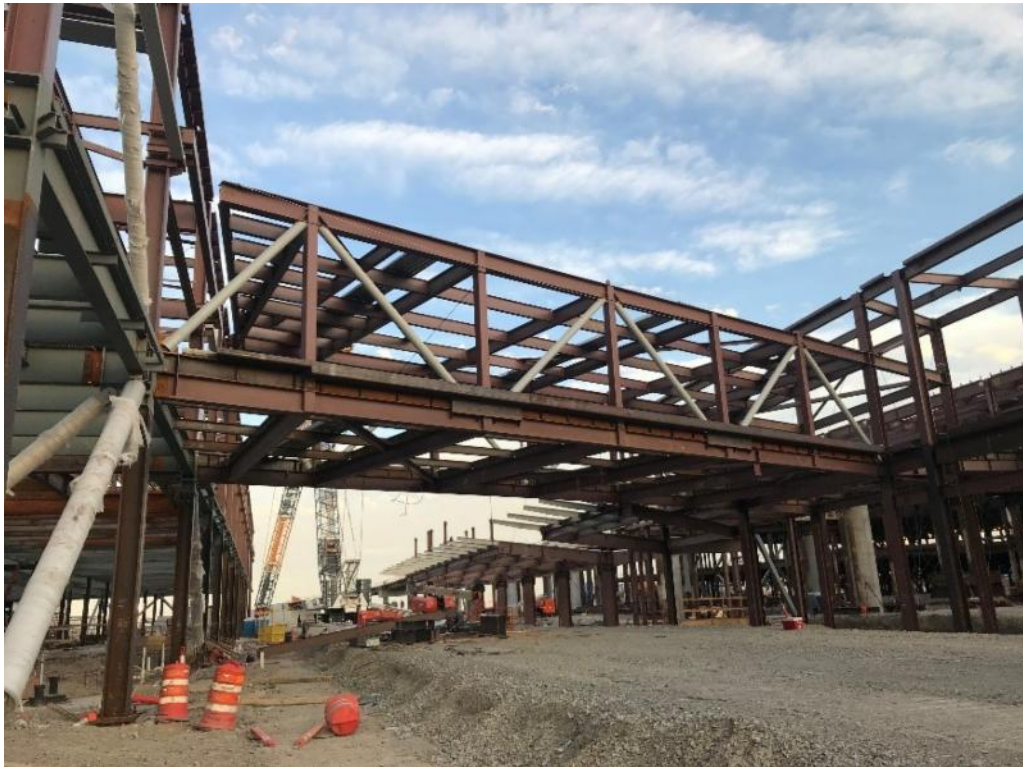
Pedestrian bridges installed from the Gateway to the Terminal