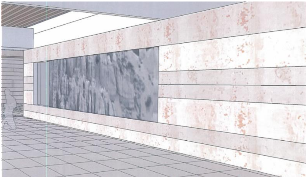
Rendering of The New SLC Art Wall location.

The Salt Lake City Department of Airports and the Salt Lake Arts Council have announced an exciting opportunity for artists. When The New SLC opens in fall of 2020, the facilities will feature a number of unique art installations. One of the installations is The New SLC Art Wall, which will be a large art installation (30 x 11 feet) located at the TSA security checkpoint.