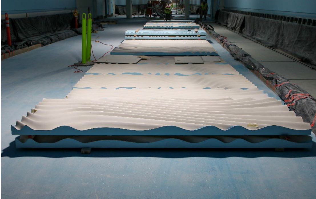
The River art installation—by artist Gordon Huether—wall panels ready for placement in the Central Tunnel

For more updates on construction progress, click here .