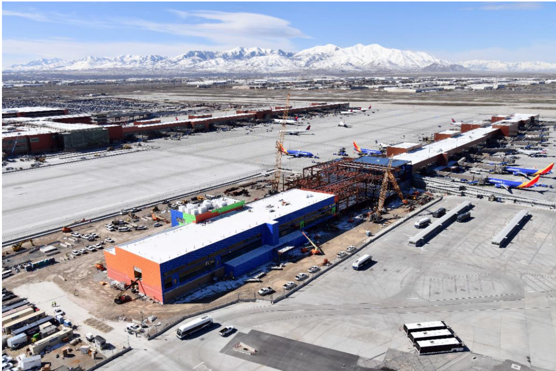
Aerial view of Concourse B-west and the beginnings of Concourse B-east, looking southwest

One half of Phase 2 is now open, while Phase 3 of The New SLC continues to be built out. Phase 2 encompasses the addition of 22 gates on Concourse A to the east and 19 concessions. Phase 3 includes a mini-Plaza area, the Central Tunnel – to provide another connection between concourses A and B – eight gates to the east of Concourse B and more shops and restaurants. The following photos highlight the work underway.