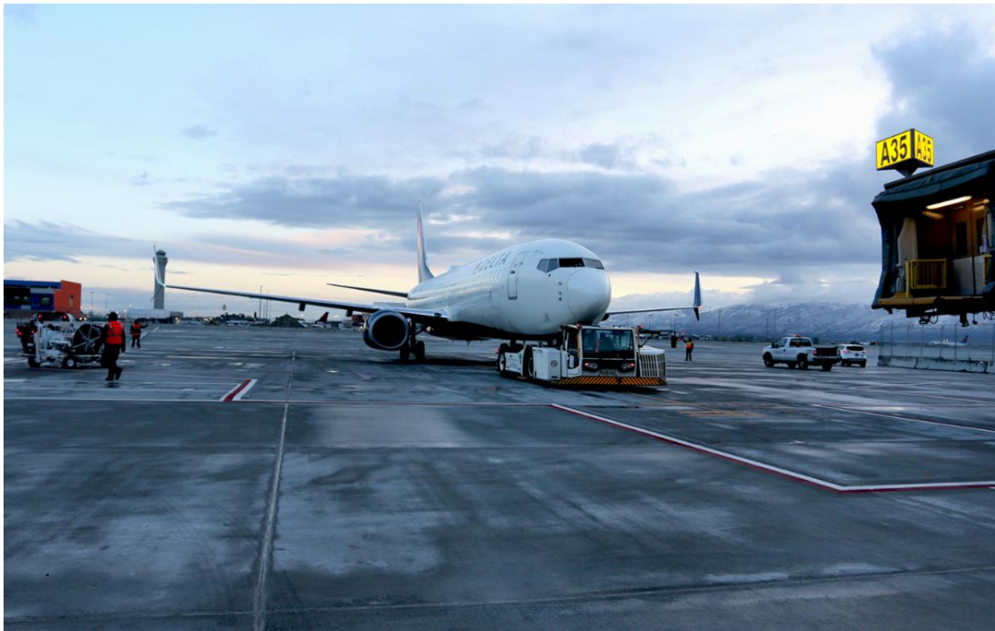
Aircraft fit test for the five gates now operating on Concourse A-east