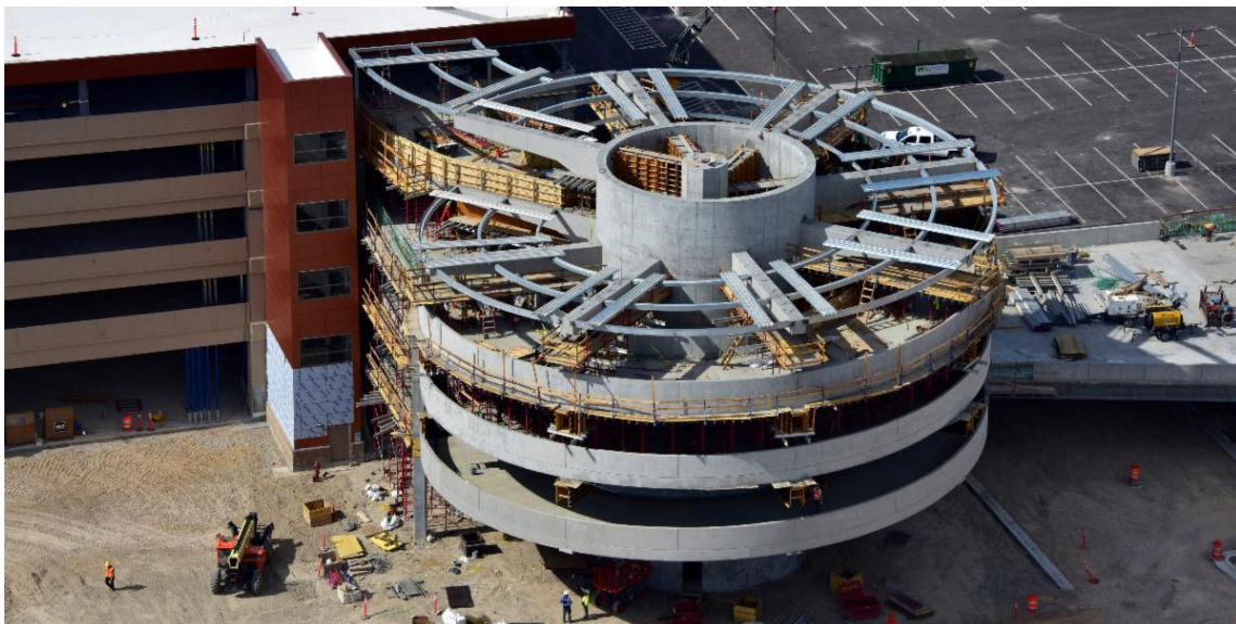
An aerial view of the parking garage's east helix being constructed in June 2020.