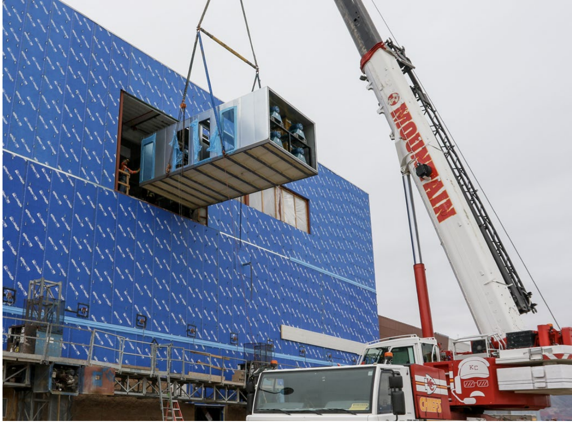
Delivery of air handling units on Concourse B-east