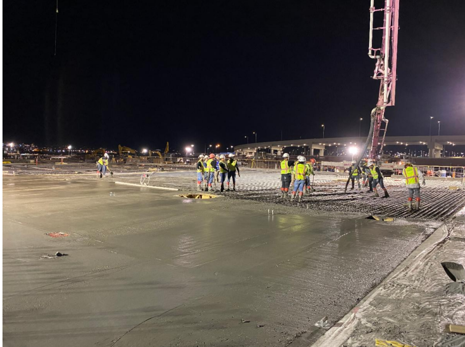
Slab pour underway on Concourse A-east