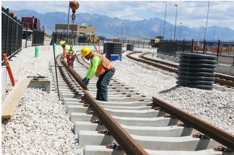
TRAX light rail extension under construction

For more updates on the progress of Phase 2, click here .