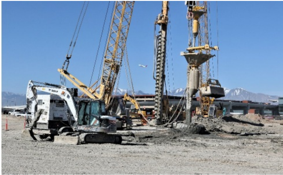
Final stone column placement

Work on Phase 2 of The New SLC is progressing nicely with a number of milestones reached in the past few months. Placement of the stone columns for Concourse A-east has been completed and concrete pours are ongoing. Steel erection is expected to begin in early August. In addition, work on a permanent tunnel connecting A and B Concourses is well underway.