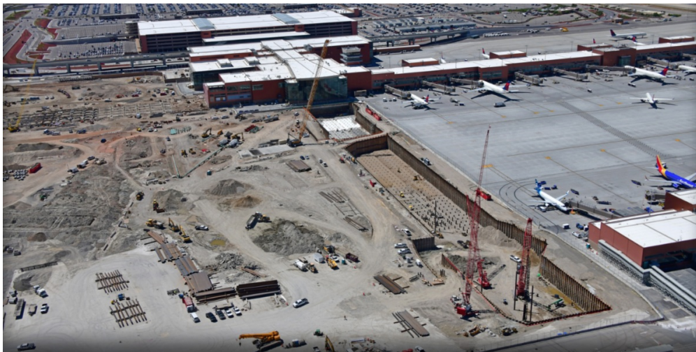
Aerial view of the progress on the Central Tunnel