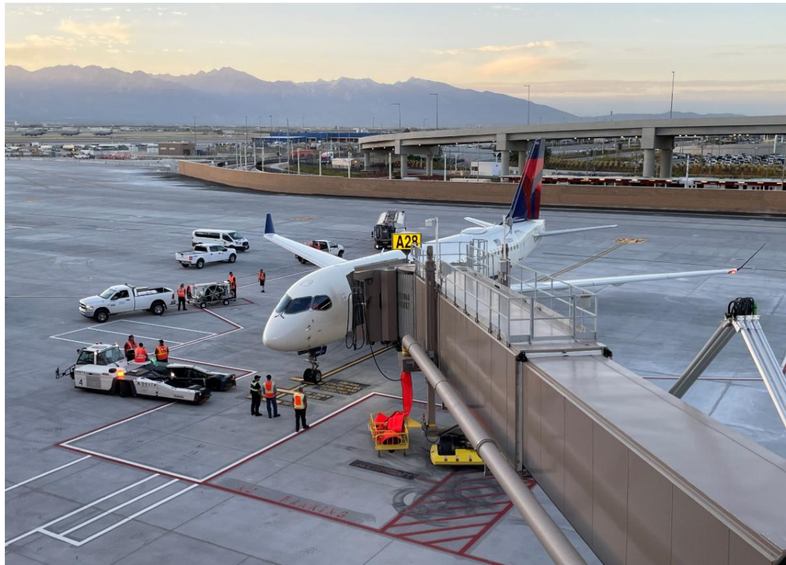
An aircraft fit test took place earlier this month for the four new gates set to open on Aug. 22