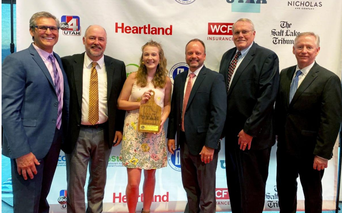
Salt Lake City Department of Airport's Commercial Management team accepts the Taste Utah Dining Award at the Restaurant Industry Awards Gala in May.

The Utah Restaurant Association recognized SLC Airport with a Taste Utah Dining Award at its annual Restaurant Industry Awards Gala held Tuesday, May 30 at Rice-Eccles Stadium. The award recognizes The New SLC Phase 1 restaurants and acknowledges the airport's exceptional contributions to Utah's food, restaurant and hospitality industry. Salt Lake City Department of Airport's commercial management team attended the gala and accepted the award on SLC's behalf.