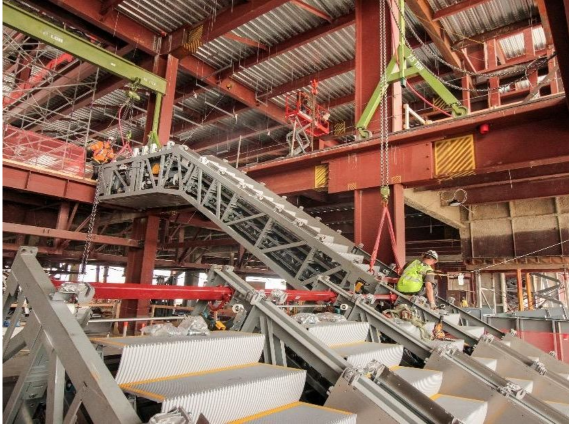
Escalators being installed in the Concourse B Plaza