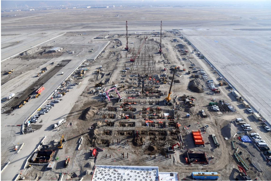
Phase 4 infrastructure work is underway with the installation of steel columns.

eight gates will extend to the east on Concourse B. Phase 4 is tracking close behind. The following photos highlight the work underway.