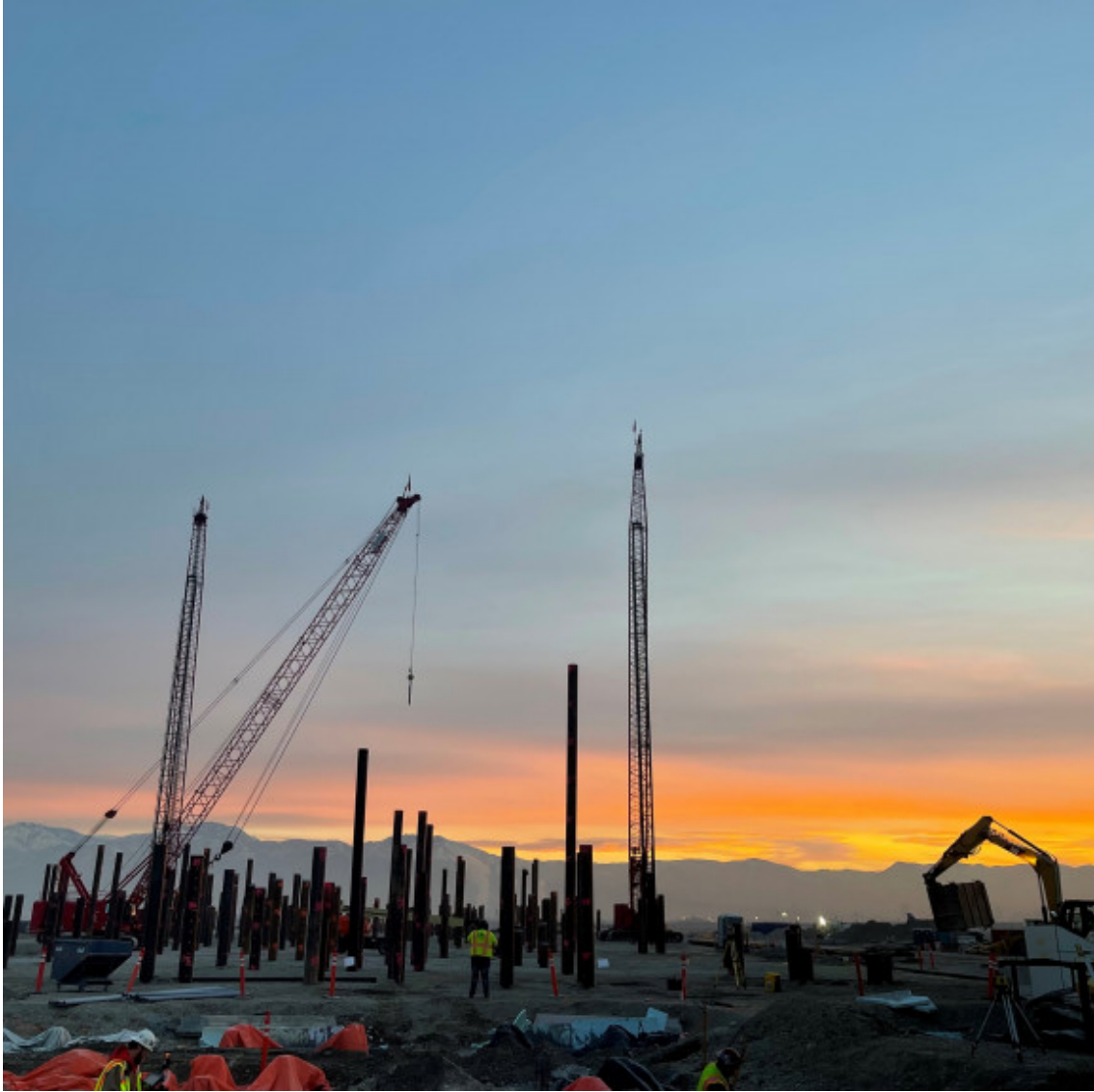
The sun sets on a day of work of pile driving on Phase 4.