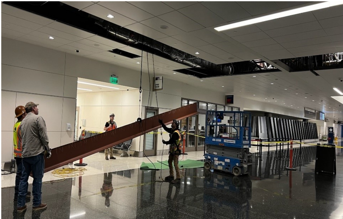
Steel beams are added through an opening in level 2 of the Terminal building to support more ticket counters on level 3.