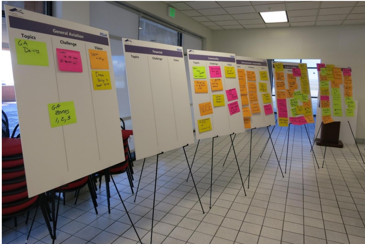
FIGURE 1-2 VISIONING CHARRETTE FOCUS POINT BOARDS