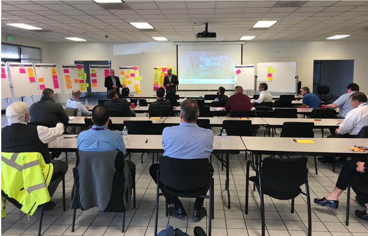
FIGURE 1-1 VISIONING CHARRETTE

Each board had three columns: "Topics," "Challenge," and "Vision," which were used to further guide the process and the comments provided, as shown in Figure 1-2 .