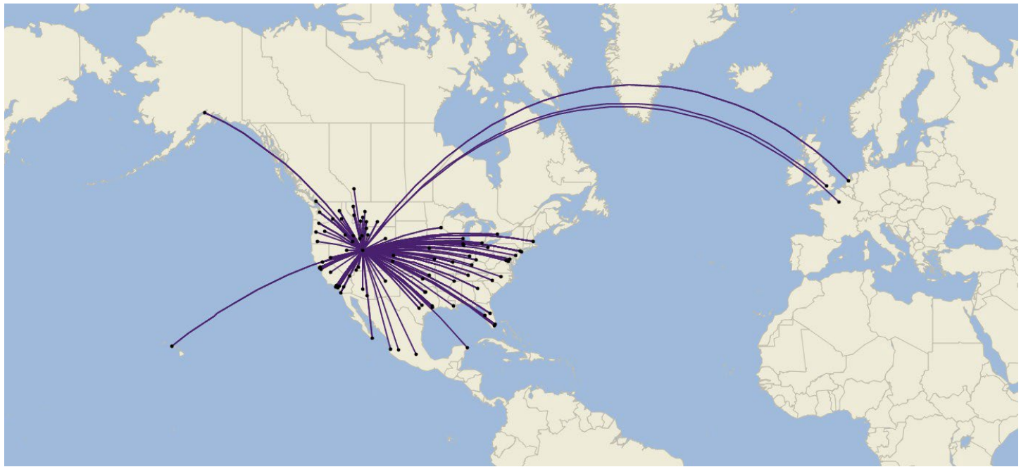
Average Daily Departing Seats: 47,000 Nonstop Destinations: 96