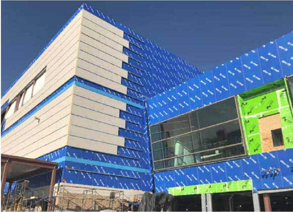
Exterior work on the South Concourse-West begins with placement of a green-colored sheathing, which is a base material. Next, a blue moisture barrier is installed, followed by a beige insulation layer and then glass installation. The final layer is the installation of copper cladding that completes the exterior look.